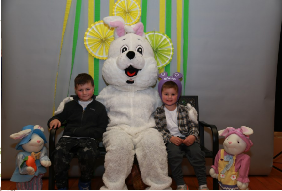
Easter Egg Hunt!